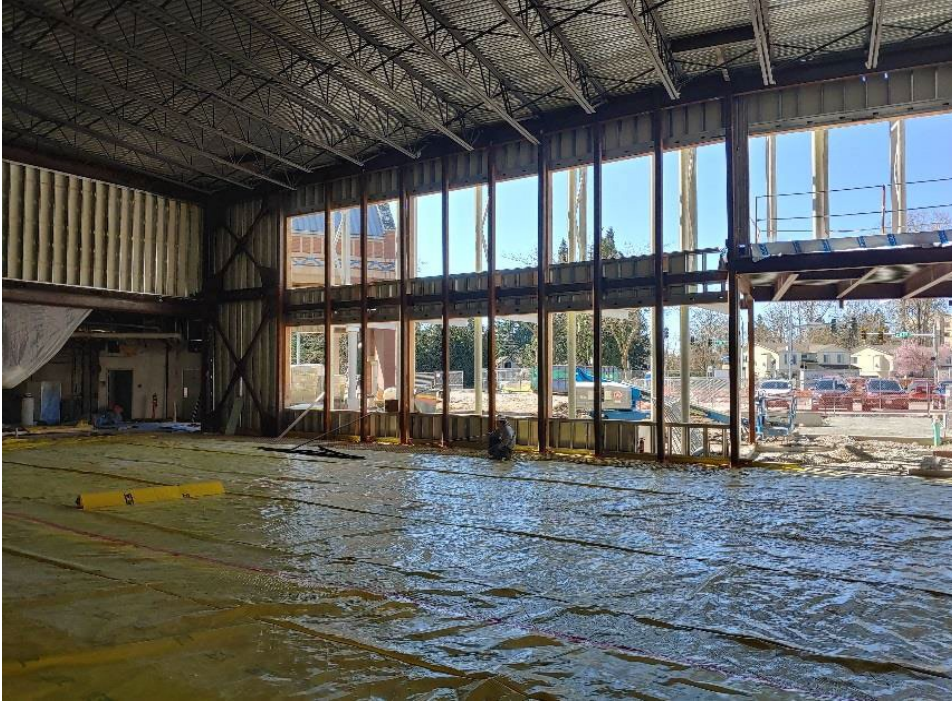
Commons – concrete floor prep work is ongoing.