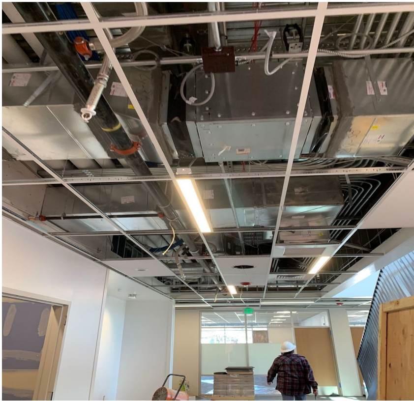
Mechanical Rough in