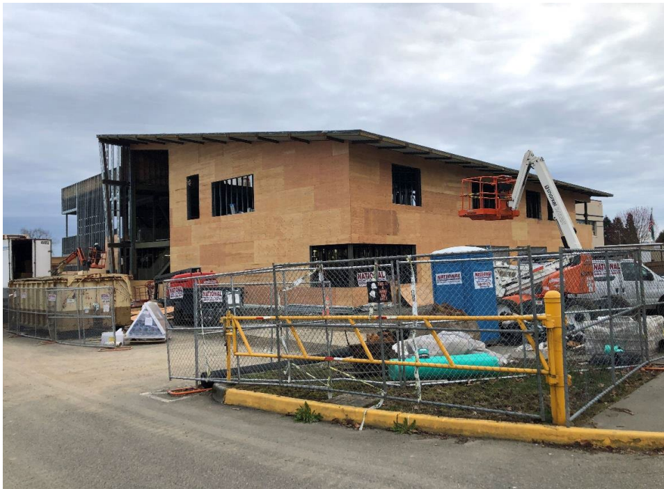
Southwest elevation of new Building B, with plywood sheathing complete.