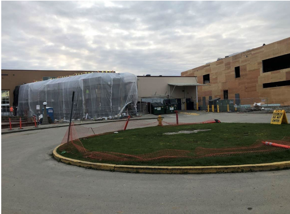
Bus drop-off in the foreground, looking southeasterly at the Commons Addition (Bldg. A) left, and new Building B on the right