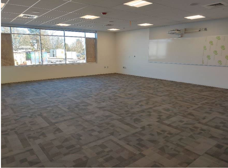
Area A – Carpet installation is complete.