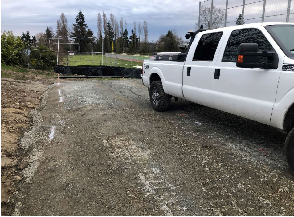
Hammerhead turnaround behind the gymnasium, to be used by Fire Department for access.