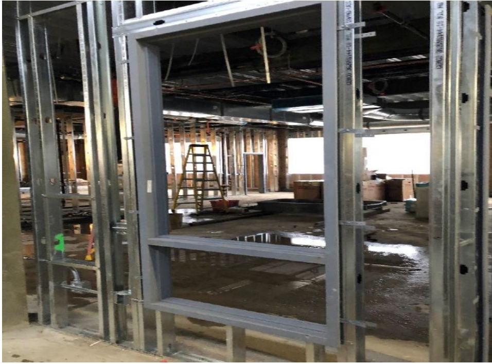
Interior window frame installed in Building B.