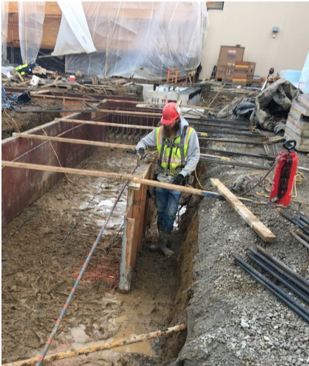
Bldg B – Working on the footings.