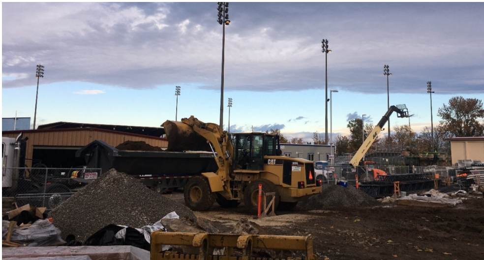
Bldg. B Dirt work – excavating.