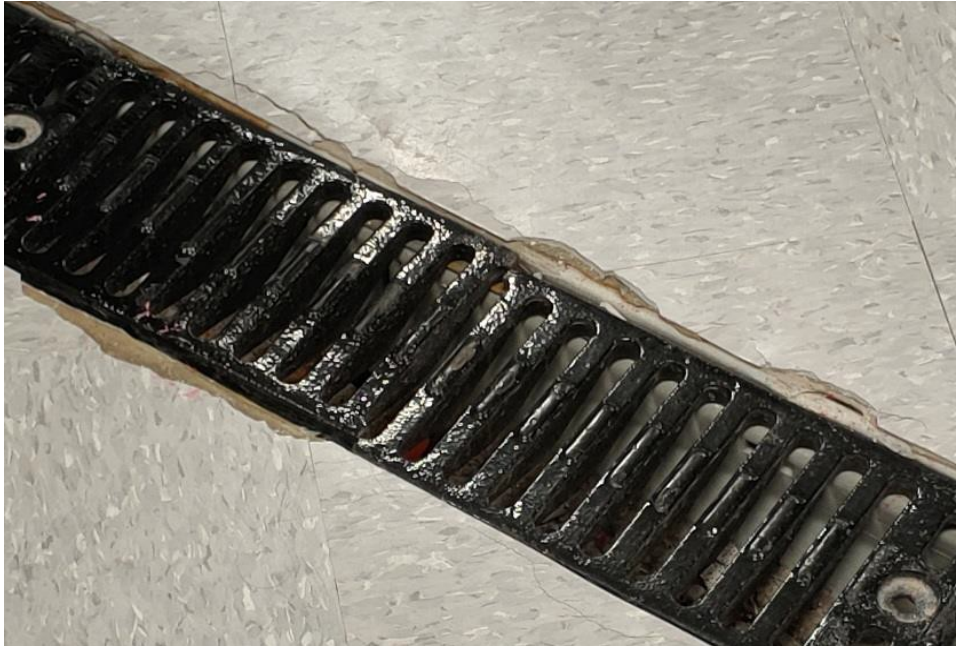
Area C - Tile in Art Room 140