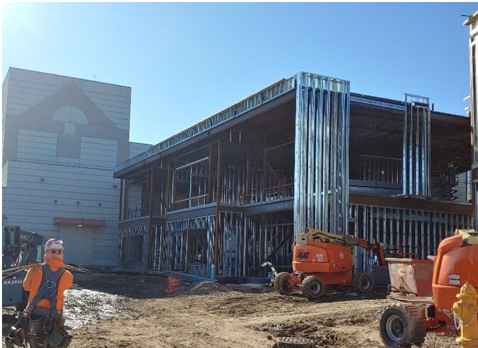
Area B – East of Academic Building