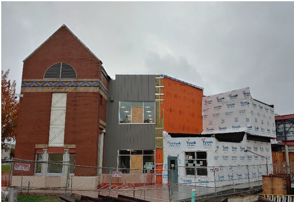
Area E – Administration Area