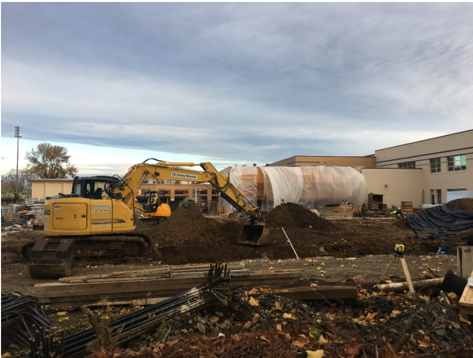
Bldg. B Dirt work – excavating.