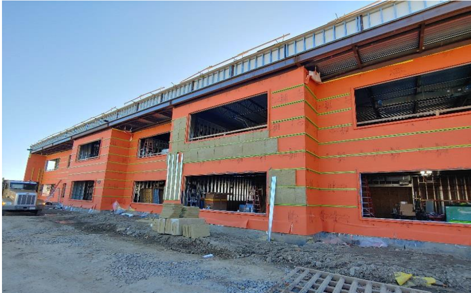
Area A – North of Academic Building