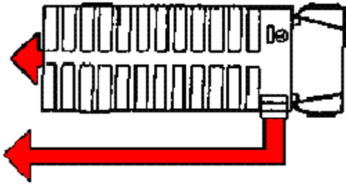
Front and rear door Evacuations

Pupils leave the bus and take 50 steps (100 feet) behind the bus and form into a group.